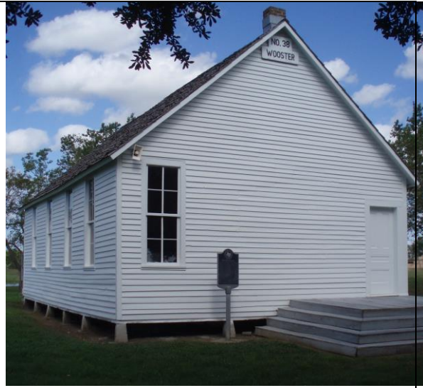
WOOSTER COMMON SCHOOL DISTRICT NO. 38 On original site in Wooster, circa 1913.